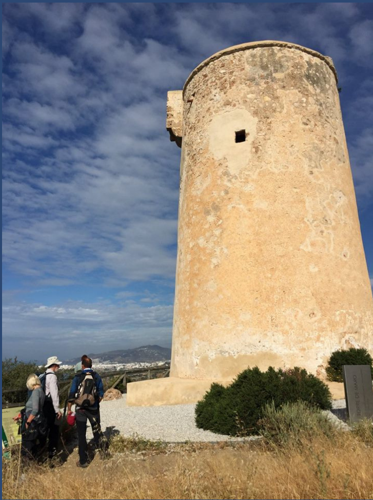
Lookout tower on wild orchid walk