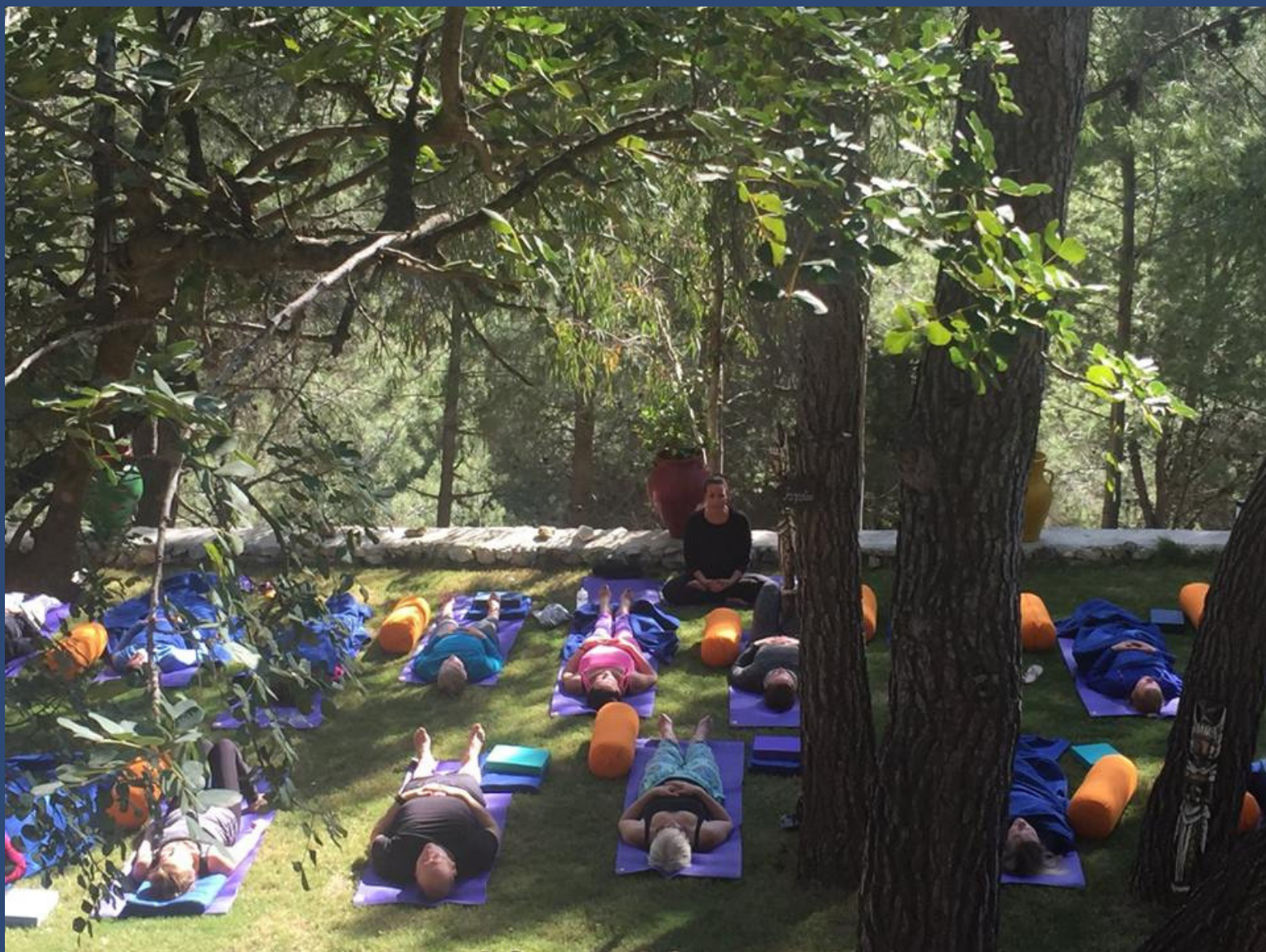
Outdoor yoga at the walking lodge