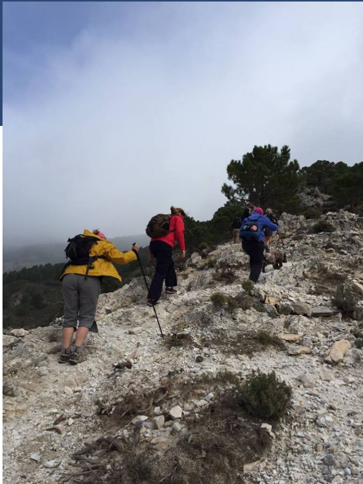
Ridge of Mt Lucero