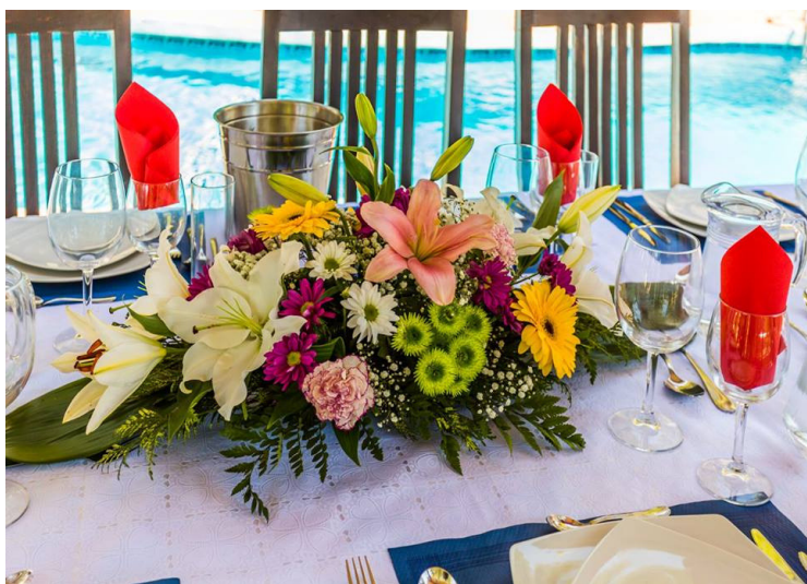
Dinner around the pool at the walking lodge