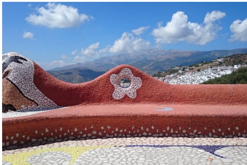
Beautiful Andalusian countryside