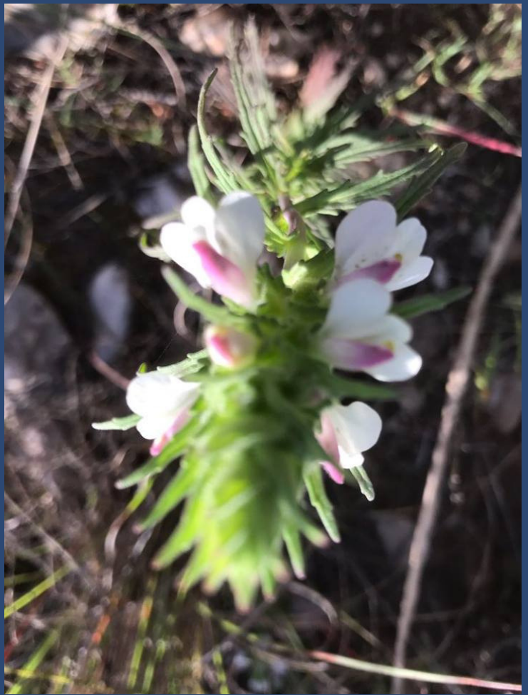
Discoveries on wild orchid tour