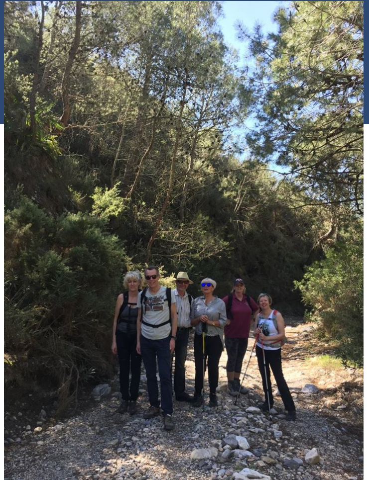
River bed walking